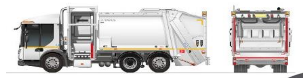
26 tonne Dennis Eagle Duo (Residual/Food - Flats)