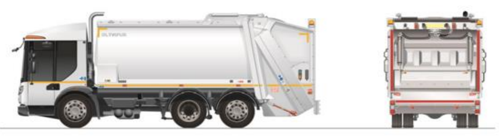
26 tonne Dennis Eagle Olympus (Residual Waste, Garden Waste)